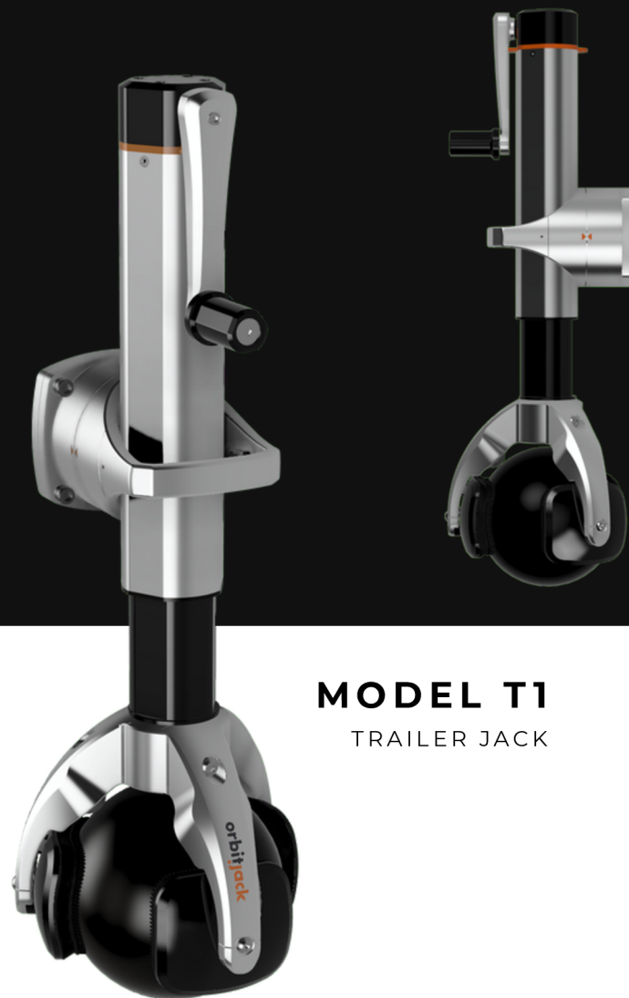
MODEL T1 TRAILER JACK

Front-facing pull-handle, right where you would expect it